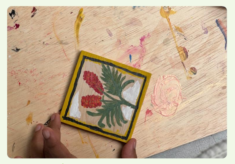
Malaysia | arts and crafts