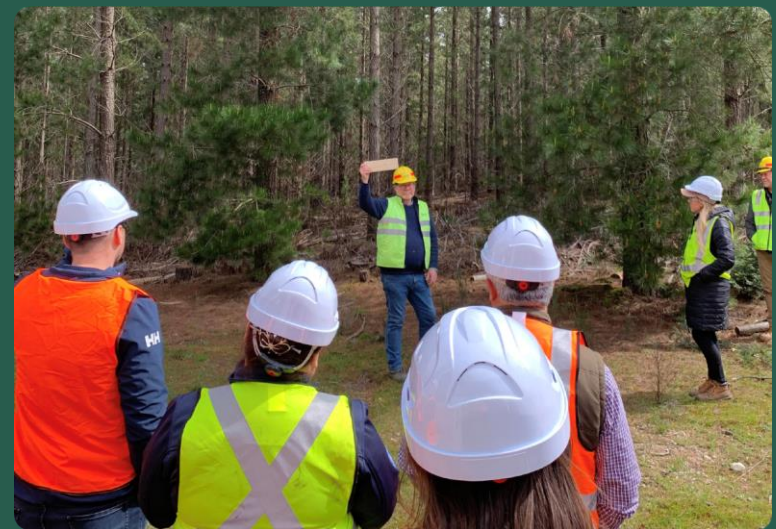
Australia | forest walk