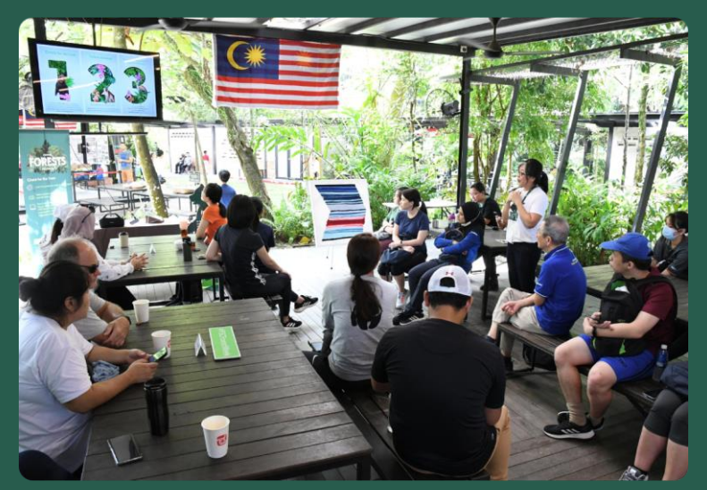
Malaysia | celebrating forests on the ground