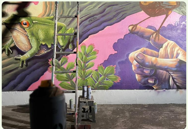
Chile | arts and crafts