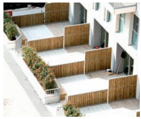
FSC certified timber fencing

One lasting benefit is that several suppliers achieved FSC CoC certification as a direct result of the requirements of this project. This enables the rest of the industry to benefit from improved availability of certified, responsibly sourced timber in the future.