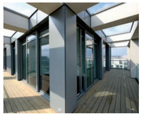
N15 block A balcony showing FSC certified timber flooring