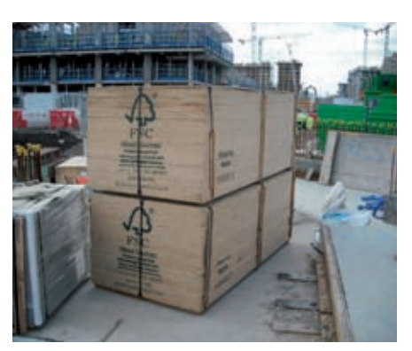
FSC certified timber stock